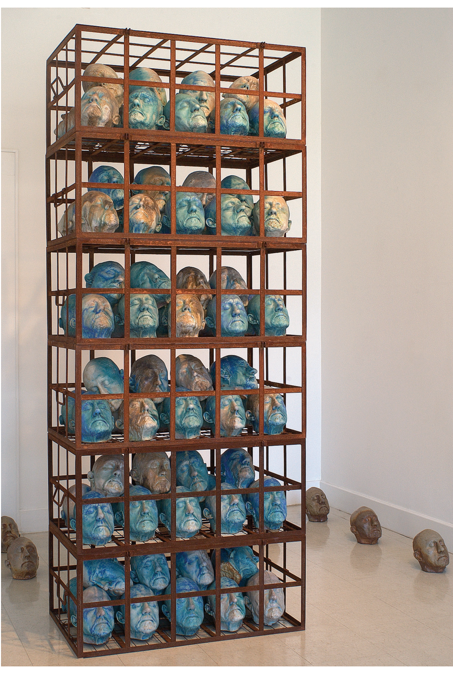
TONY MOORE: WHO KNOWS WHY? 2006 84" X 300 sq. ft. size variable 150 body-cast human heads steel, ceramic, wood-fired 5 days

One theme that pervades this disparate work is the tension between the manifested world in contrast with the liminal and ephemeral sphere. Another is the contrast between what is life enhancing and what is destructive to living entities. Moore's work asks us to confront these dichotomies. For example, in "Who Knows Why?" we see approximately