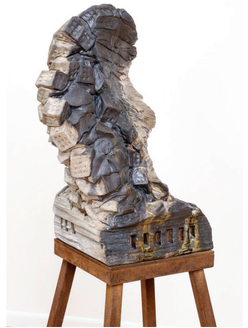
Tony Moore, The Injustice of Silence , 2017, clay and steel, courtesy of the artist